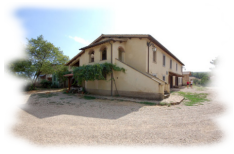
BioBagnolese Agriturismo - Castel Bagnolo www.biobagnolese.it