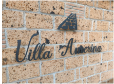
Agriturismo Villa Amerina - Corchiano