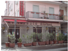
Hotel Benigni - Campagnano www.hotelbenigni.it