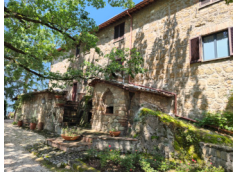
La Locanda della Chiocciola - Orte www.lachiocciola.net

Nights in double room in **/ *** hotels , B&B and agriturismi with breakfast