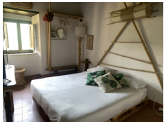
Opera Suites - Calcata www.operacalcata.com