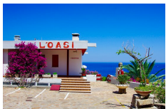
Hotel Oasi - Cala Gonone

Hotel Sant'Elene is located 3 kilometres from Dorgali, in the center of Barbagia area and gate for Gulf Of Orosei. Hotel is a family run, offers spacious and bright rooms with rustic style with air conditioning, TV, private bathroom with shower. Wifi is free in the hall. Breakfast is various and natural.