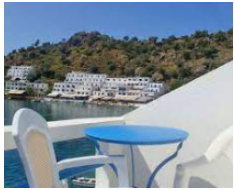
Hotel Kyma - Loutro http://kyma.com.es/