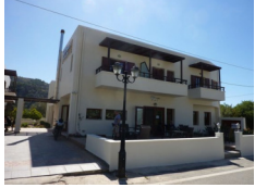
Hotel Syia - Sougia www.syiahotel.com