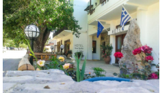
Hotel Neos Omalos - Omalos www.neos-omalos.gr