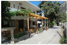
B&B Pachnes Pension - Agia Roumeli www.pachnes.gr