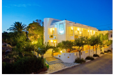
Hotel Aris - Paleochora www.arishotel.gr