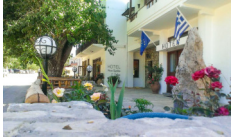
Hotel Neos Omalos - Omalos