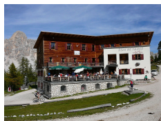
Fanes Hut - San Vigilio di Marebbe

The mountain refuge Sennes, 2126 m, is located in the Fanes-Senes-Braies National Park. Rooms have a mountain style and they are well-finished and clean. Breakfast is good and the cuisine offers Tyrolese specialties. Staff is courteous and helpful.