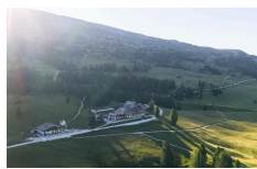
Hotel Hohe Gaisl - Prato Piazza

7 nights in mountain huts and hotel on HB basis (no at Sennes)