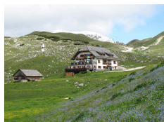
Sennes Hut - St. Vigil Enneberg

The mountain refuge Sennes, 2126 m, is located in the Fanes-Senes-Braies National Park. Rooms have a mountain style and they are well-finished and clean. Breakfast is good and the cuisine offers Tyrolese specialties. Staff is courteous and helpful.