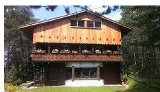
B&B Villa La Bercia - San Vigilio di Marebbe

Fanes Hut is located on the Dolomites above the town of San Vigilio di Marebbe. Rooms are made by wood, well-furnished and comfortable. The cuisine offers traditional dishes Ladin, but international too. Owners are helpful and welcoming.