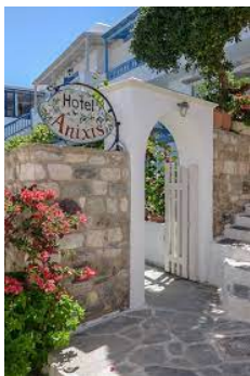
Hotel Anixis - Naxos

7 nights in bed and breakfast basis (3 nights in Naxos, 4 nights in Santorini)