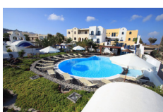
Kalimera Hotel - Santorini