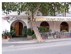
Hotel de Mecina Fondales - Mecina Fondales