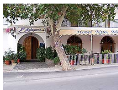
Hotel de Mecina Fondales - Mecina Fondales