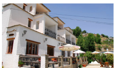
Hotel Los Berchules - Berchules www.hotelberchules.com