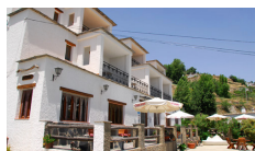
Hotel Los Berchules - Berchules