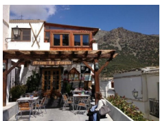
La Fragua - Trevélez hotellafragua.com