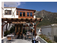
La Fragua - Trevélez