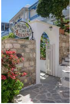
Hotel Anixis - Naxos www.hotelanixis.gr

7 nights in bed and breakfast basis (3 nights in Naxos, 4 nights in Santorini)