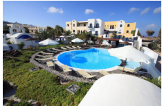
Kalimera Hotel - Santorini www.kalimerasantorini.com