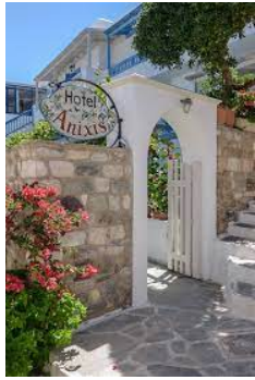
Hotel Anixis - Naxos www.hotelanixis.gr

7 nights in bed and breakfast basis (3 nights in Naxos, 4 nights in Santorini)